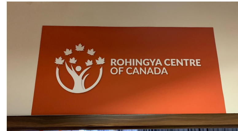
Attended the grand opening of the Rohingya Center of Canada in Kitchener