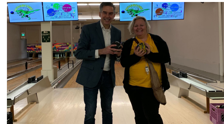
Joined our community at New Hamburg Lanes Bowl for Ukraine event