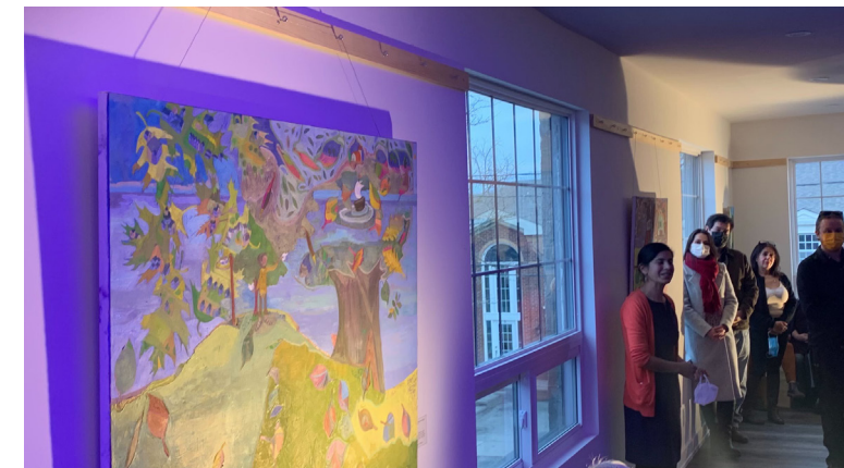
Visited the soft opening of the Neruda Arts Studio in St. Jacobs