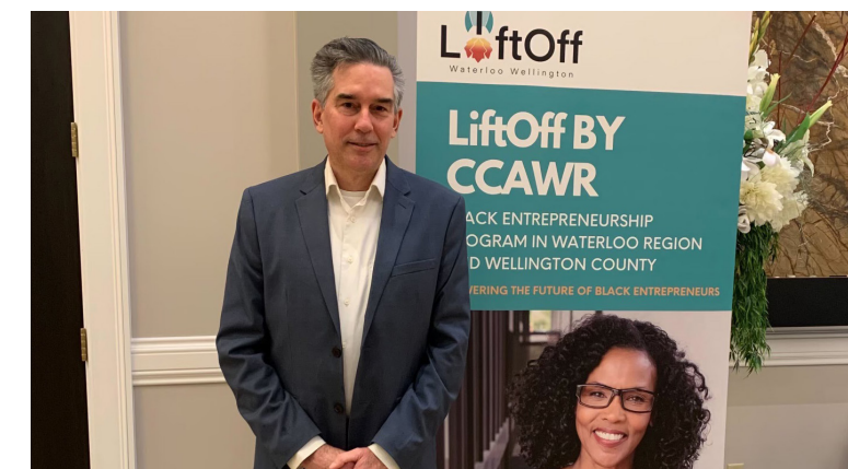
Honoured to attend the Black Business Showcase hosted by LiftOff by CCAWR in Waterloo