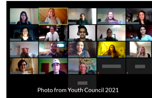
Photo from Youth Council 2021

The Youth Council works collaboratively throughout the school year to advocate for issues of importance and complete projects and events of their choosing. If you, or someone you know between 14 and 21 would like to join the Kitchener-Conestoga Liberal Youth Council, follow the QR code and apply now. I look forward to meeting you and hearing your ideas!