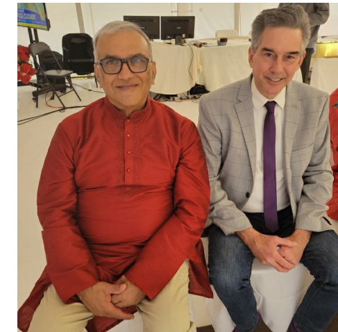
Congratulations to the Radha Krishna Mandir and Cultural Centre for opening the ground-breaking of their new Mandir.