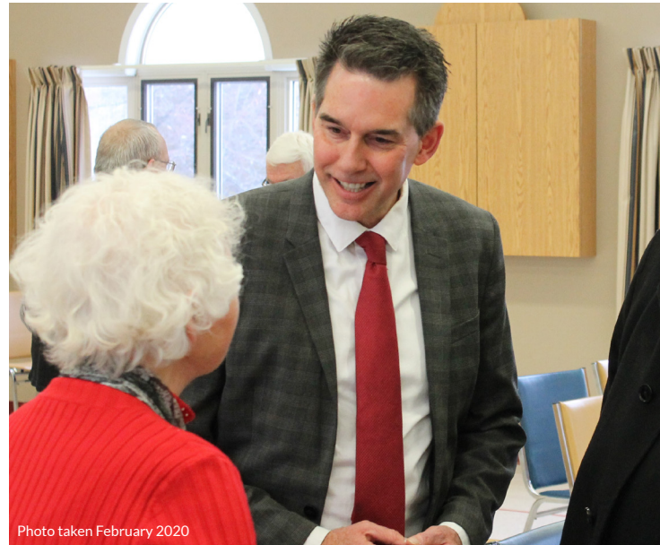
Photo taken February 2020

I will continue to advocate the importance of supporting seniors.