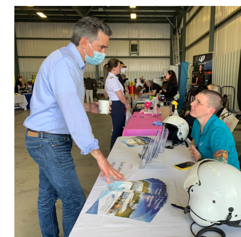
Loved attending The Waterloo Wellington Flight Centre's annual event, Girls Can Fly. It was a great day promoting the aviation industry to girls and young women.