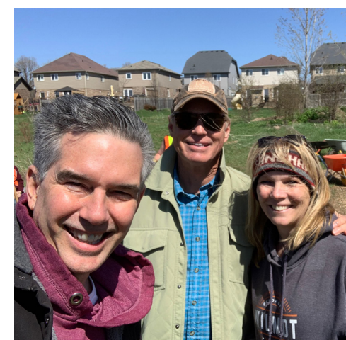
Spent a sunny day with Let's Tree Wilmot, planting trees at the Mike Schout Wetlands Preserve. Thanks to all the volunteers who came out to help.