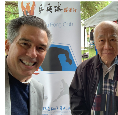
Thanks Waterloo Region Chinese Canadian Association for hosting the Spring Fun Fair celebrating Asian Heritage Month.

Attending events in our community are meaningful ways of meeting with you. I look forward to seeing you this summer, and I appreciate every conversation we have. Let me know how I can help support you, your business, and your loved ones.