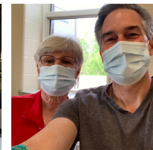
Thank you to everyone who donated blood and volunteered on Victoria Day in New Hamburg at Steinmann Mennonite Church.