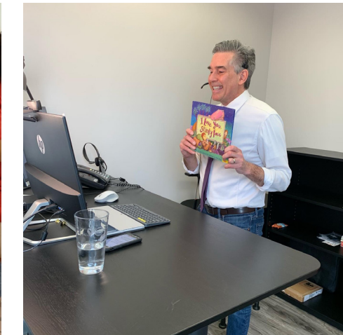
Had a fun virtual visit reading "I Love You Stinky Face" to the students of St. Teresa of Avila in Elmira. Thanks for having me!