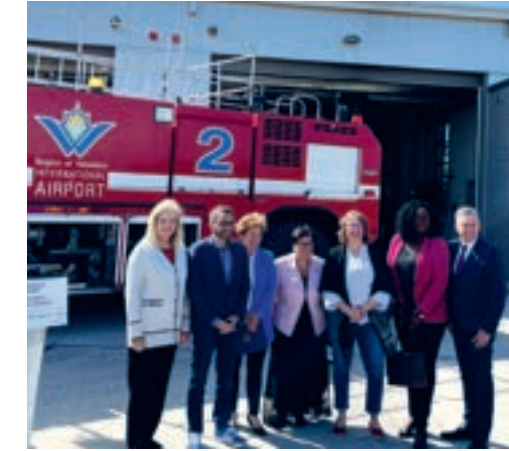
Omar Alghabra, Minister of Transport, visited Breslau for a funding announcement at the Region of Waterloo International Airport. The federal government has invested $3 million in funding for two rescue and firefighting vehicles.