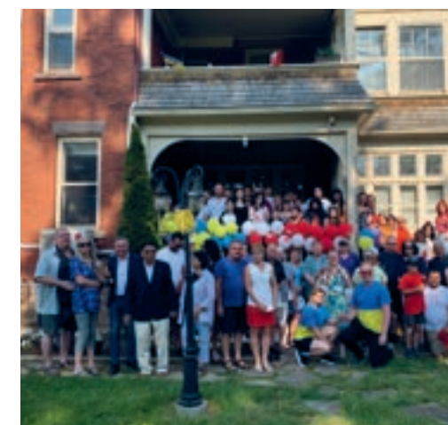
Proudly attended a celebration at the Woolwich Guest House for Ukrainian Refugees in St. Jacobs. The house provides transitional housing for residents as they find work and permanent housing. Thanks to the donors, volunteers and partners for your support.