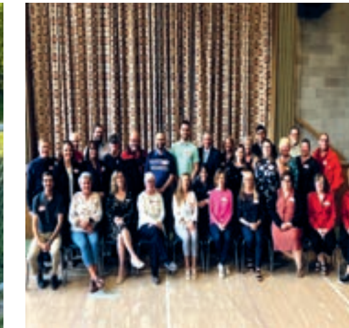
Attended the Elmira Maple Syrup Festival's Grant Dispersal . I was inspired to hear the amazing work our community organizations do. The festival raised $35,000 in grants to well-deserving recipients.