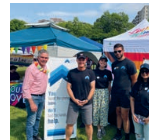
Proud to join with friends and local organizations at the TriPride Festival in Kitchener - celebrating love, diversity and equity. Let's continue working together to build a more inclusive society where everyone can be their authentic selves.