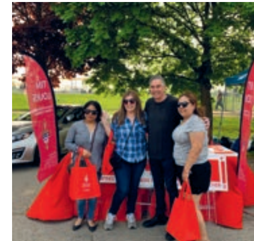
Everyone enjoyed the food, music and fun at the Victoria Day New Dundee Community Fireworks . Thanks to all of the volunteers who made this event happen!

Attending events in our community are meaningful ways of meeting with you. I look forward to seeing you this summer, and I appreciate every conversation we have. Let me know how I can help support you, your business, and your loved ones.