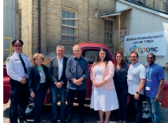
Love Your Neighbour Communities (LYNC) Mill Street Project Housing announcement in New Hamburg.

Everyone deserves a safe and affordable place to call home. Inclusive, affordable housing is the key to creating strong communities.