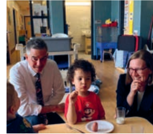
Held an important Early Learning and Child Care roundtable in Kitchener with Karina Gould, Minister of Families, Children and Social Development. We discussed affordability, accessibility and inclusion of quality child care.