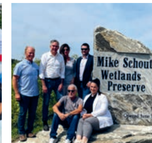
Congratulations on the opening of the Mike Schout Wetlands Preserve . This nature preserve, in the heart of New Hamburg, supports wildlife and protects the environment. It will be shared by our community for all to enjoy for generations to come.