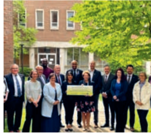
Announced over $5.5 million in funding through the Canada Ontario Community Housing Initiative, with Ahmed Hussen, Minister of Housing and Diversity and Inclusion. Funding will create 41 new units to help families in Kitchener.