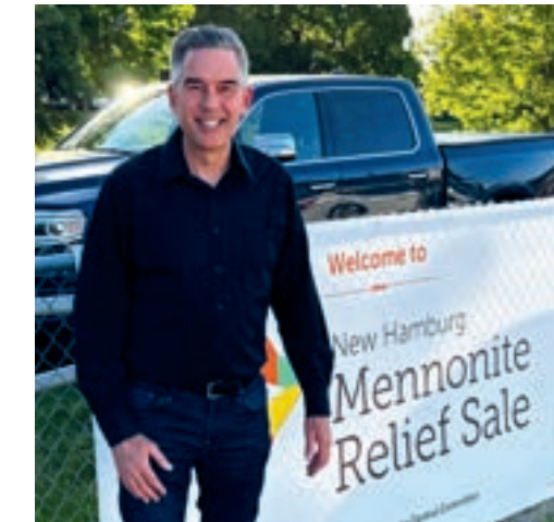
The Mennonite Central Committee hosted their yearly New Hamburg Relief Sale raising over $333,000. Our community gathered for the auctions, delicious food and family activities.